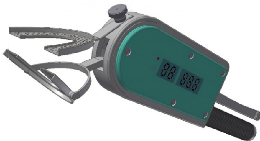
Fig. 1. Appearance of the device of own design for dosed active-passive mechanic therapy of mandibl

We developed pathogenetically sound and clinically effective therapeutic scheme for masticatory muscles contractures in which active and passive jaws mechanical therapy is a dominant factor. In the context of advantages and disadvantages of existing devices we constructed a modern device for active and passive jaws mechanical therapy (patent for invention № 111394 UA, A61S 19/00) [20] (Fig. 1).